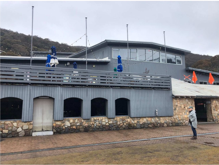
WINDOWS ON NORTHERN FACADE OF ALPINE HOTEL